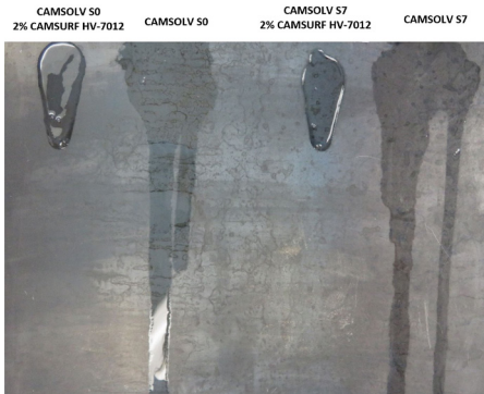
VISCOSIFYING PROPERTIES OF HV-7012 WITH DIFFERENT SOLVENTS (Brookfield RVF Viscometer, #2 spindle, 21°C, 20 rpm)